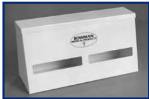
0927-GC-009 Bulk Dispenser, White Plastic, 5"x11"x4", 12/cs

Made especially for your bulk gloves, this dispenser is made of durable high impact white plastic. Gloves dispense from opening in front, and feature a hinged lid for easy filling. Mounts easily with 2 screws (not included).