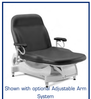
Shown with optional Adjustable Arm System

With an 850 pound patient weight capacity, the Ritter 244 is ready, willing, and able to safely lift your special needs patients time and time again. By lowering the seat to 18 inches, the Ritter 244 performs this sometimes difficult task. It becomes a very simple routine requiring minimal assistance from you and your staff. The patient's dignity is maintained and the likelihood of injury is greatly reduced, thus providing efficient patient care. The Ritter 244 raises the seat to a height of 34 inches, effectively bringing the patient to you while helping minimize the stress and strain on your back. By having the patient in the right position, the exam can be completed properly and efficiently. The Ritter 244 features a 32-inch wide seat that offers unsurpassed patient comfort and support for your special needs patients. The seamless design of the upholstery looks great and offers an easy-to-clean surface. The thick foam padding with built-in pillow provides the comfort your patient deserves. Available in 7 standard Ritter colors.